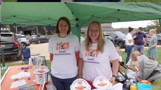
Family Fun Day