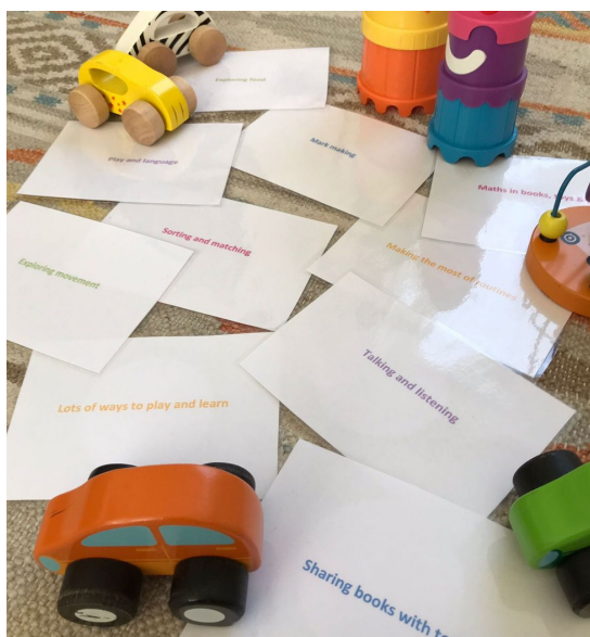
Our first PEEP course