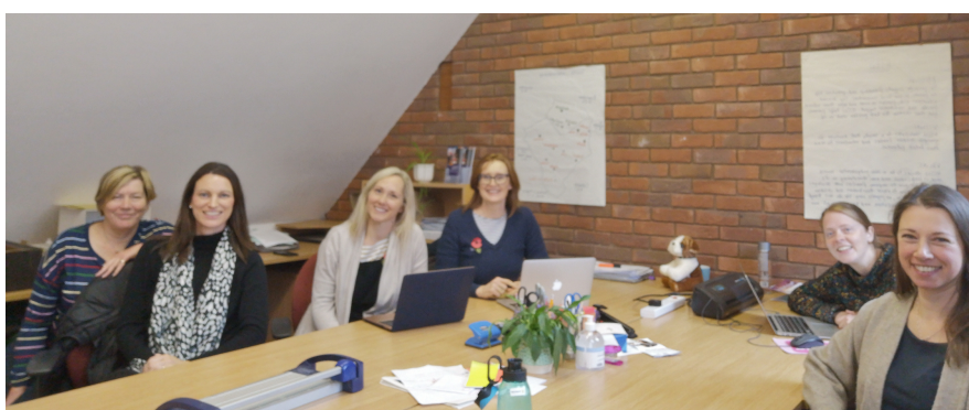
Moving into our first office!